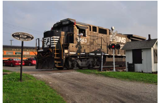
19 th Street Re-Created!