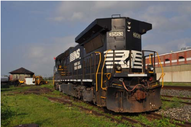
On the West-End: Getting ready to move to Front Yard.