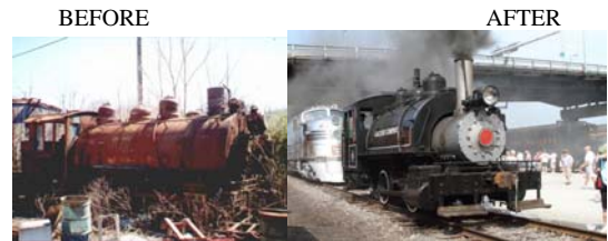
Viscose Company #6 - Baldwin 0-4-0